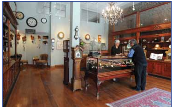
Wall cases display mantle clocks (opposing walls) and vintage grandfather clock (center). Antique display cases also serve as customer counter.

After 20 years in the same location in Bozeman, Dave Berghold moved The Last Wind-Up down the street to the location of the old Bozeman Watch Company. The building was substantially more spacious with much of the infrastructure already in place. It houses his repairs and retail stock and provides plenty of