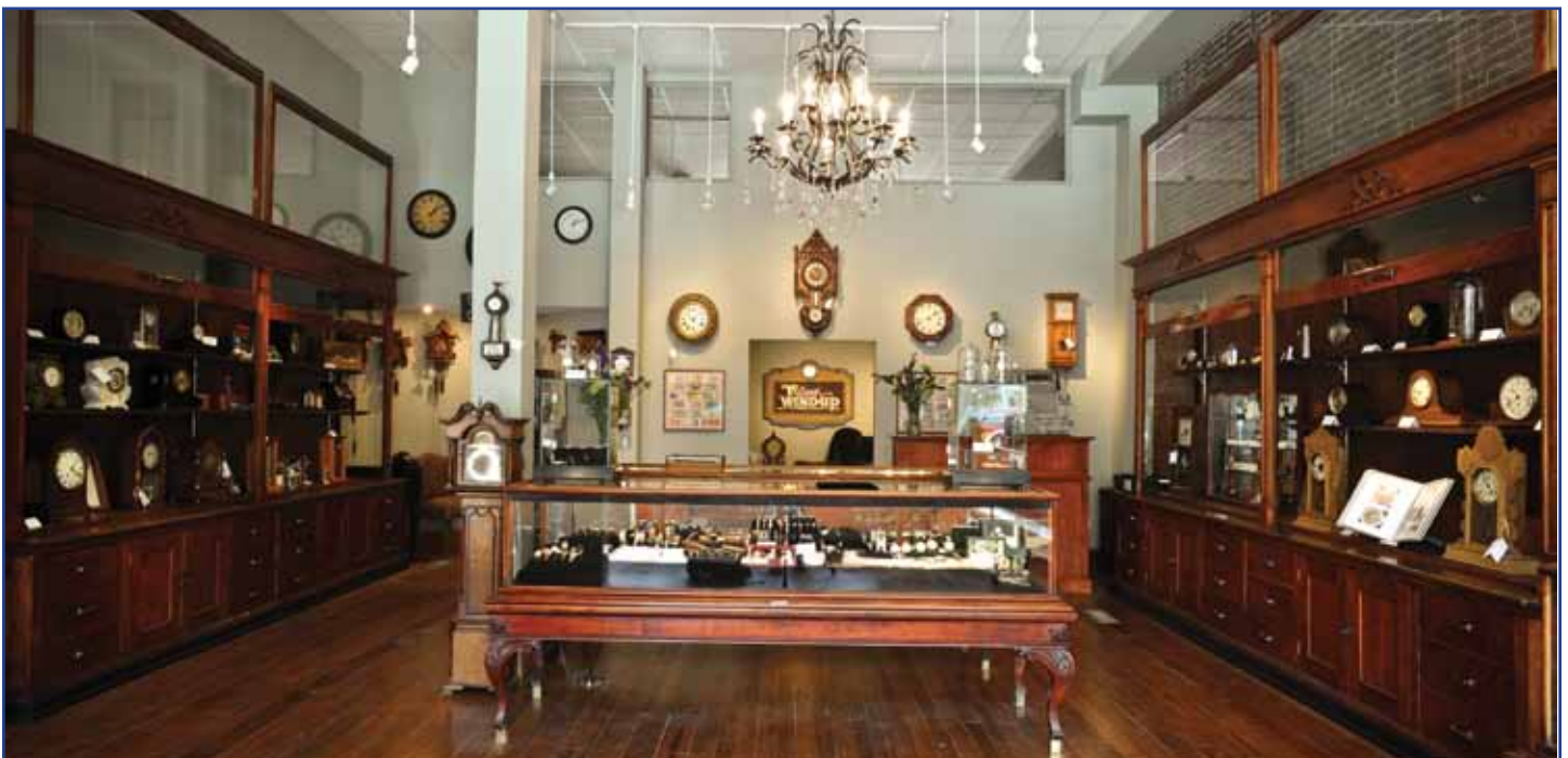
Chandelier, drop ceiling and upgraded display lighting create a warm and inviting showroom image.