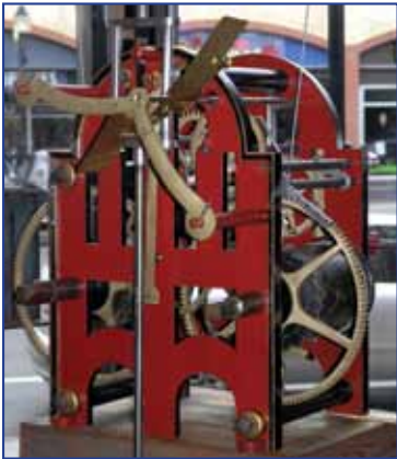
The 1880s Tower Clock displayed in the southwest window of The Last Wind-Up often draws a crowd.